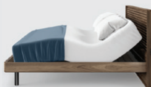
Platform Position: Low Frame Position: High Platform Height: 11 in | 28 cm (12" Adjustable Mattress shown)