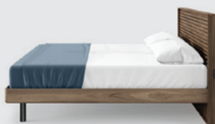
Platform Position: High Frame Position: High Platform Height: 14 in | 36 cm (10" Mattress shown)