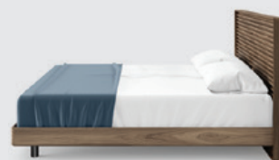
Platform Position: Low Frame Position: Low Platform Height: 8 in | 21 cm (14" Mattress shown)