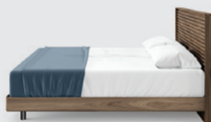
Platform Position: High Frame Position: Low Platform Height: 11 in | 28 cm (12" Mattress shown)