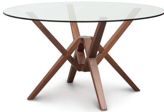
60" Round Glass Top Table 6-EXE-36-04 60"w x 60"l x 30"h