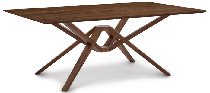
48" x 84" Table 6-EXE-13-04 48"w x 84"l x 30"h