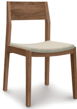
Iso Sidechair 8-ISO-40-04