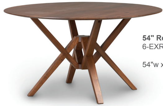
54" Round Table 6-EXR-54-04