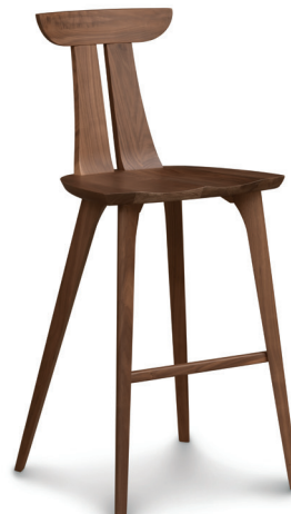
Estelle Bar Stool - seat height 30" 8-EST-65-04