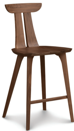
Estelle Counter Stool - seat height 26" 8-EST-60-04