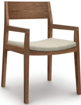
Iso Armchair 8-ISO-42-04