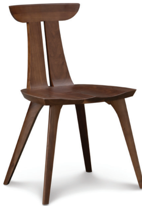
Estelle Side Chair 8-EST-50-04