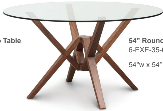
54" Round Glass Top Table 6-EXE-35-04 54"w x 54"l x 30"h