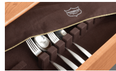
The silverware drawer is fitted with an anti-tarnish insert.