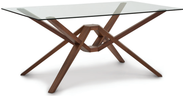
42" x 72" Glass Top Table

Exeter Glass Top Tables are topped with clear tempered 15 mm glass (glass tops are imported) highlighting the unique geometry of the table base.