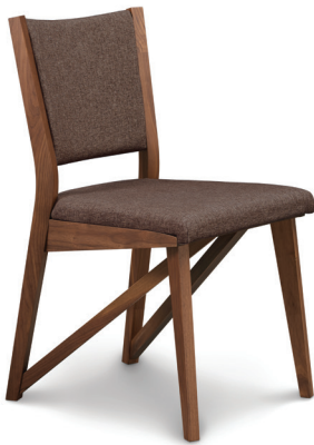
Exeter Chair 8-EXE-50-04

Upholstered items are available in a range of microsuede, fabric, UltraSuede®, UltraLeather® Original by UltraFabrics®, Upholstery Fabrics and Luxury Plains Collections by Sunbrella or leather colors as well as COM (customer's own material). Please refer to the upholstery page of this catalog.