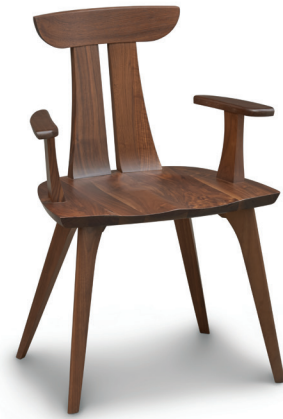
Estelle Arm Chair 8-EST-52-04