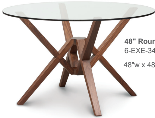
48" Round Glass Top Table 6-EXE-34-04 48"w x 48"l x 30"h